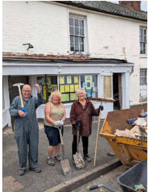
Getting ready for the builders

We have just heard that AMP (the About Music Project), which for many years put on Party in the Park, is being wound up and they are donating £1,000 to the Stars Appeal. Our heartfelt thanks to them for this marvellous gesture of support.